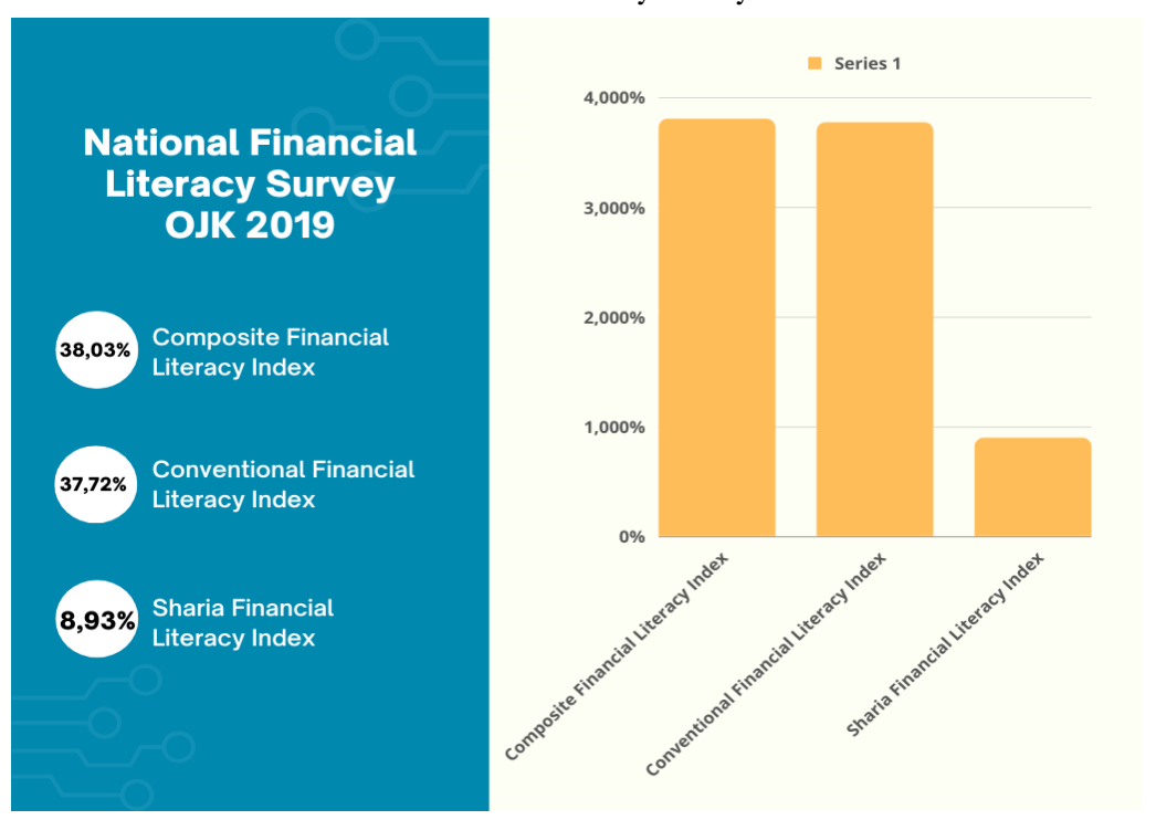
Graph 1 Results of the 2019 National Financial Literacy Survey