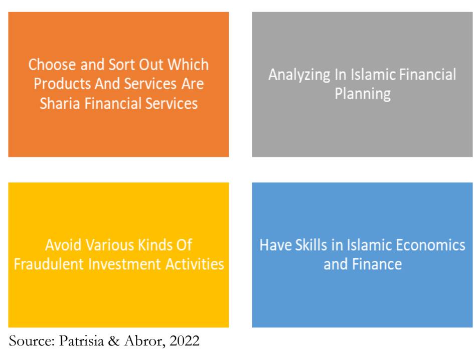
Diagram 2 Islamic Financial Literacy for the Millennial Generation

Islamic financial literacy is very important for all parties, including the millennial generation for several reasons, namely the millennial generation plays a critical economic role because the number of the millennial generation is very large and dominates in Indonesia (Sosianika & Amalia, 2020). The next reason is that the millennial generation is very vulnerable financially because many spend money just for fun rather than saving and investing to add assets. The next reason is that the millennial generation is more easily fooled by influencers so many are trapped in fraudulent investments because they are promised very large interests so that many young people are deceived. These are some of the reasons that make Islamic financial literacy very important and useful for millennials.