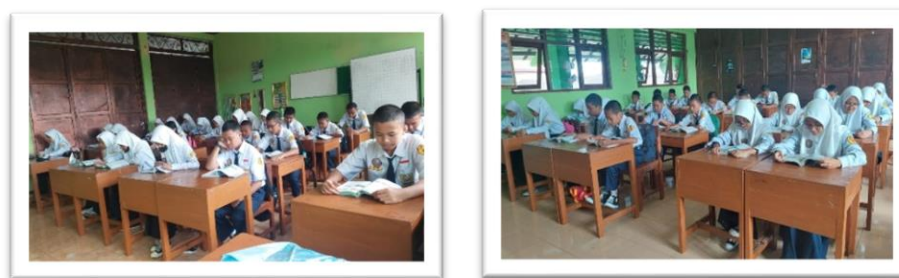
Figure 1.3 Literacy in the School Classroom

In the library of SMP Negeri 1 Kartasura, there are not only books available, there are also computers that make it easy to find information and material sources through the computer, the teacher is more directed to look for material information online, and students are also happy to find material information online compared to offline. The teacher at the school also suggested that they must include sources in finding material information such as Wikipedia, the teacher at the school gave an example of material about the Hajj chapter using video media about the Hajj chapter and looking for the core source of the material and books about the material being studied. In the mushola of SMP Negeri 1 Kartasura there is also a Al-Qur'an reading corner, but there is no Al-Qur'an interpretation book in the school.