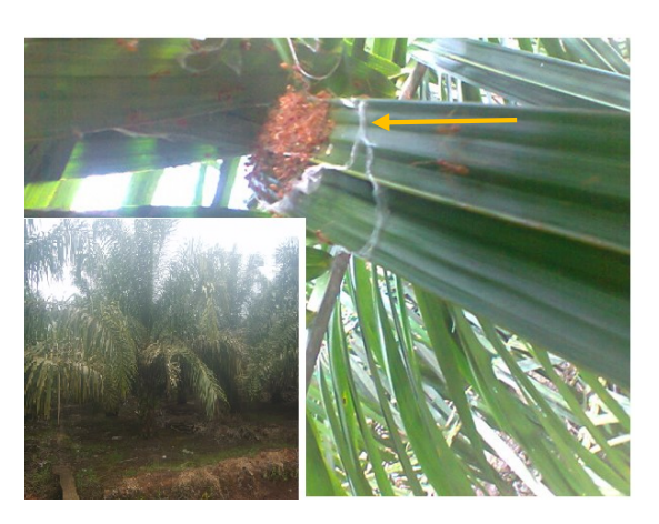
Figure 1. Oil palm plantations occupied by colonies of O. smaragdina have no symptoms of caterpillar attack.

control on oil palm crops. Referring to (Dejean et al., 2010; Kluge, 2000) that this technique of natural control is more effective and environmentally friendly, and sustainable it needs to be applied, one of which maximizes the role of predators or predators.