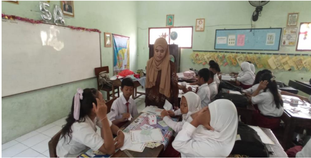
Figure 2. Monopoly-assisted PAKEM Model Treatment

The use of the monopoly-assisted PAKEM model affects critical thinking skills. In line with (Anggriasari et al., 2020), the success of learning using the monopoly-assisted PAKEM model is characterized by a well-developed learning process. During the learning process students were very excited because researchers delivered learning using LCD Projectors with ppt and learning videos, they were learning to use LCD projectors for the first time. The atmosphere during the learning process becomes interactive, active, and students are not sleepy or bored. Students are very focused when the researcher explains the material. Students also find it easier to understand the material. Then when using monopoly learning media, it becomes more attractive to students and students become even more eager to learn. Because this medium is collaborated with games. So, students learn with pleasure and are not saturated or bored, even students become more active. Monopoly learning media also teaches students to be honest, hard work, sportsmanship, and responsibility in completing according to what is in the media because it is there (Adilah & Minsih, 2022). The material is presented in the form of questions, commands, and challenges. Games are carried out in groups, so it can encourage students to have a social spirit and communication between students.