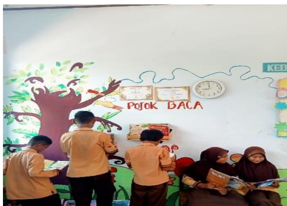
Figure 2. Students Choose and Read Books in the Class Reading Corner

The reading corner is one of the factors that influences students' interest in reading books. To overcome boredom experienced by students, teachers design an attractive reading corner with different designs, and change books regularly once a month. The goal is to make the reading corner more interesting, fun, and comfortable for students to use (Megantara & BS, 2021) . The reading corner is a facility in the classroom that can be used at any time by students, its comfortable and easily accessible place makes it easier for students to use the classroom reading corner. In addition, a pleasant atmosphere can also encourage students to make reading a daily habit, which ultimately contributes to increased literacy. Utilizing the reading corner through literacy activities can strengthen students' analytical skills in evaluating situations and making the right decisions based on deep thinking, optimizing brain function, and expanding their horizons and knowledge. This is reinforced by research by Wijaya et al. , (2022) and Hiko et al. , (2022) which shows that the effective use of reading corners has an impact on increasing the intensity of reading and students' literacy skills . In addition, reading habits that are instilled from an early age make students more disciplined in reading, broaden their horizons, and increase their curiosity about something, thus supporting the optimization of students' potential as a whole (Jamaludin et al., 2023) .