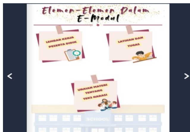
Figure 3. Module Elements