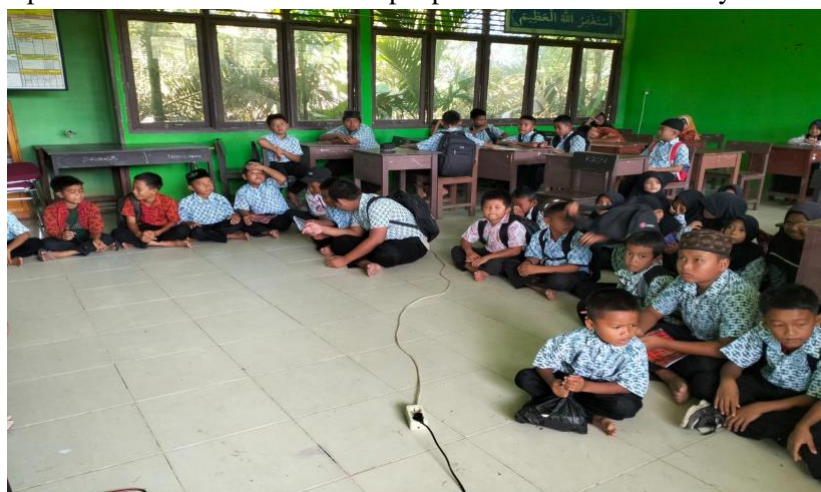
Figure 1. Student discussing

The attitudes and behavior of students at school with religious moderation education according to teacher Rudi Hartono stated that: Students always respect the opinions of their friends even though they are of different ethnicities by not disturbing friends and teachers who are expressing their opinions in front of the class, such as being quiet, paying attention, not making noise in class. , then be able to calm noisy friends, and not make fun of each other, this is an attitude of respecting different opinions as something natural and human. In this way, more students understand openness to other people's opinions so that in discussions they not only prioritize their own opinions but also those of other people so that in the end they reach a consensus.