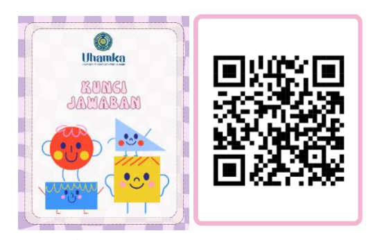
Figure 1. Answer Key Card

Based on the suggestions and input submitted by the validator, improvements and changes were made to the product, namely changing the material content on the question cards to be adjusted to operational verbs, improving knowledge cards to adapt to good and correct PUEBI, adding group identity information and reducing the number of circle steps. from the initial 20 steps to 10 steps on the mission map, and in the guide book there is a change in font type and the addition of the use of original images from the media being developed. The components suggested by the validator are answer keys and digital guidebooks which can be accessed via barcode scanning. These cards have the same size and material as the question cards and knowledge cards.