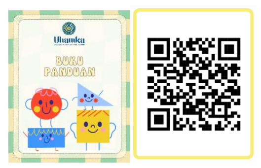
Figure 2. Guidebook card

After making product improvements in accordance with the suggestions and input provided by the validator, the Two-Dimensional Figure Jenga media is ready to be tested for widespread distribution of the media.