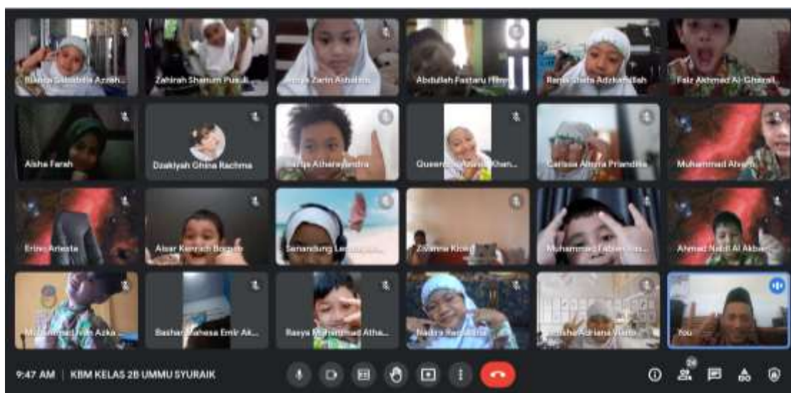
Figure 2. Extracurricular activity

Fourth, the self-development project program is a school extracurricular activity, but the process is through virtual media. There are 15 active extracurricular activities at this school, namely: the art of reading the Qur'an, karate, swimming, futsal, dance, painting, tiwisada, table tennis, chess, English contest, Mathematics and Natural Sciences Olympiad, Paskibra, Scouts, young entrepreneurs, alloys voice. These fifteen activities are active and carried out virtually once a week. The process is accompanied by the extracurricular teacher and the extracurricular assistant teacher. It is hoped that during a pandemic, children can practice their own development according to their expertise. So that they are able to be creative, disciplined and responsible in participating in this activity.