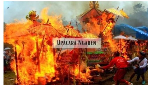
Figures 3 and 4. Process of Burning the Body

From the interview data, observation and documentation have compatibility or relevance regarding the Religious Anthropology of the Ngaben Ceremony on the Relationship between Man and His God. Where the data justifies the Ngaben tradition in Bali and this tradition has a spiritual connection. In conclusion, the data obtained from observational data, interviews and documentation data have similarities with the theory that has connected tradition with the relationship between humans and their God.