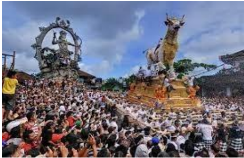
Picture 1. Ngaben Arak

which are carried out in the Ngaben procession in Bali which is carried out every time someone dies.