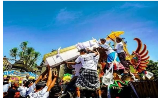
Picture 2. Placement of the Body