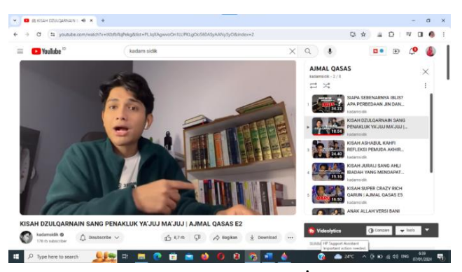
Figure 1.4 shows the video of the story of Żulqarnain that the author studied<sup>31</sup>