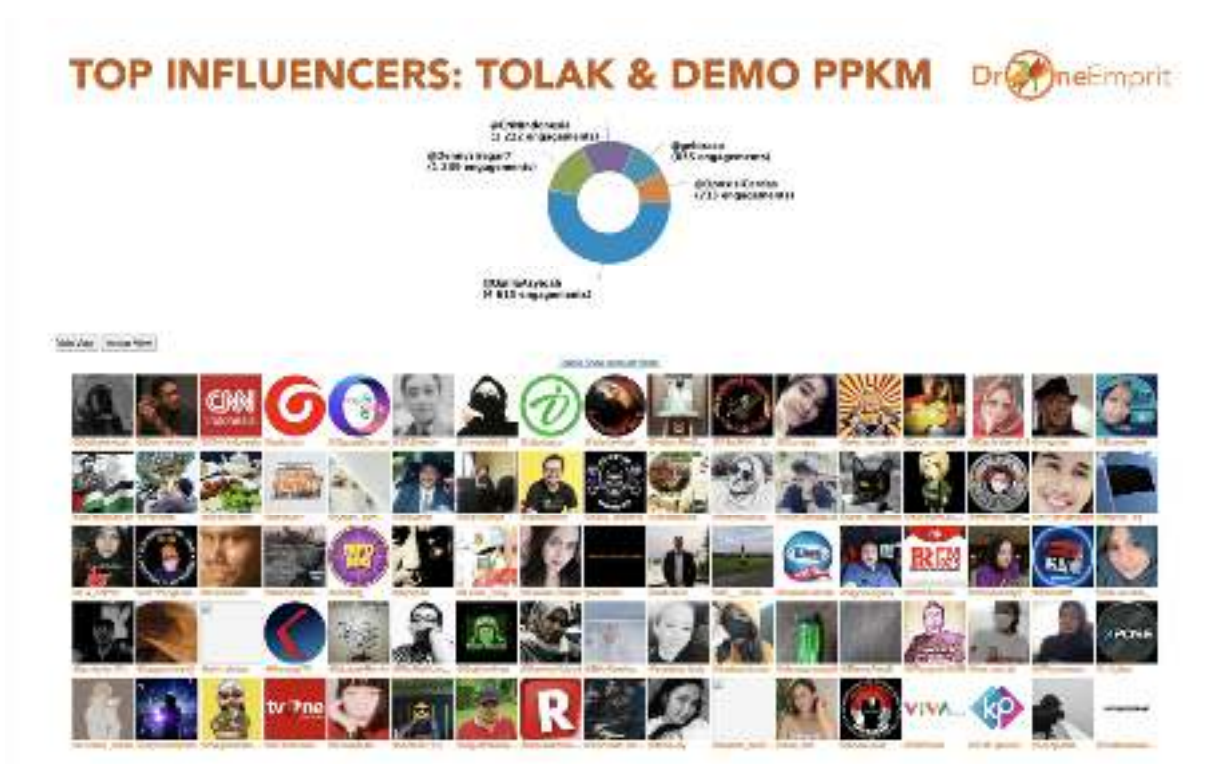
Figure 4. Top Influencer "Tolak & Demo PPKM"

Jesus & Himelboim (2018) mentioned that social movements have begun to touch the realm of social media and have become an important aspect in carrying out social movement actions in recent years. This is because social media is considered to influence and mobilize the masses and the general public easily. However, this condition cannot be separated from important actors who are the main keys to the existence of influential social movements that aim to mobilize the wider masses. Thus, Figure 4 shows that top influencers' presence is considered an important key in the PPKM trend and demo.