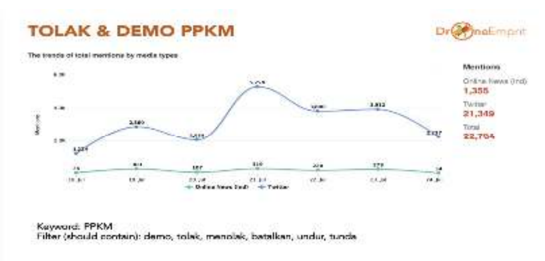
Figure 1. Trend of "Tolak and Demo PPKM"

interaction volume between account users on Twitter reached 21,349 tweets, using keywords in the demo, reject, cancel, rewind, and snooze. In addition, 1,355 articles in online news also accompanied the high volume of conversation on Twitter. Combined, the number of interactions on the trend of rejecting hashtag narratives and PPKM demos reached 22,704 within one week, with the highest number of interactions between Twitter account users and online news article releases both on July 21.